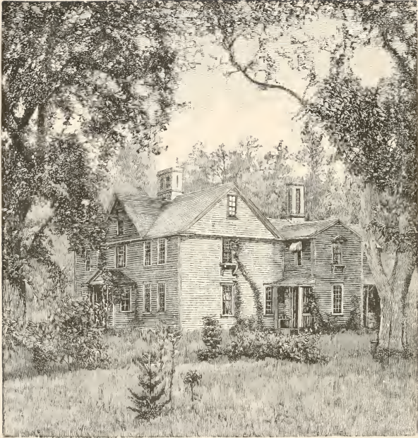
ORCHARD HOUSE, CONCORD, MASS.